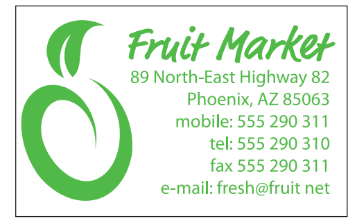
1^{9}/_{16} " x 2^{1}/_{2} "