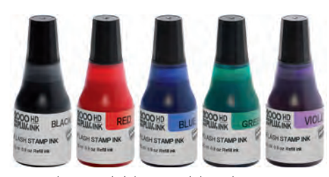
also available in gold and orange