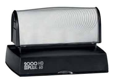
with attached flip lid