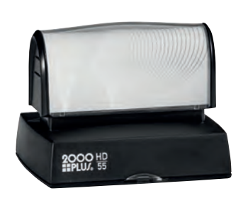
with attached flip lid